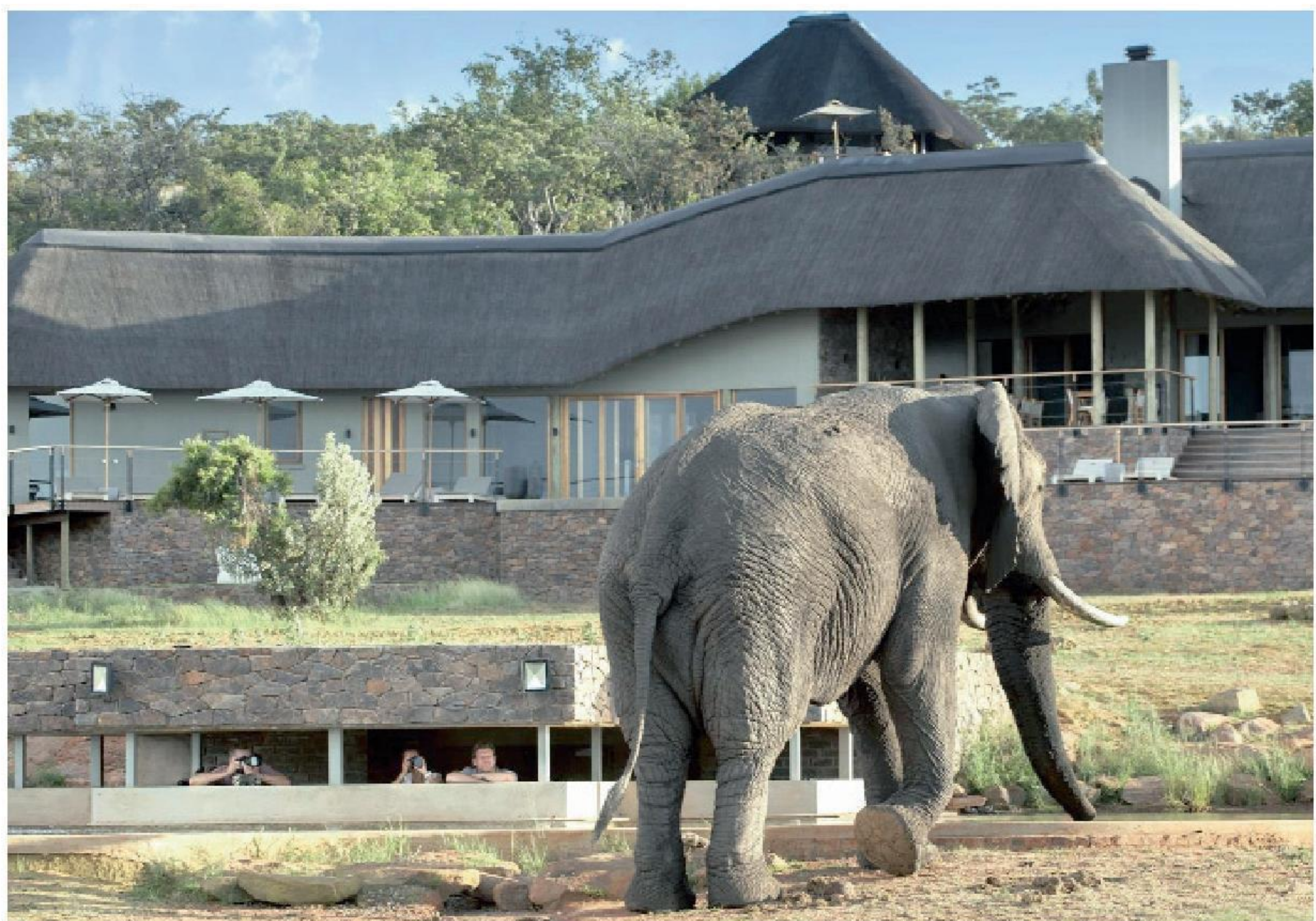
The underground viewing room overlooks a waterhole.