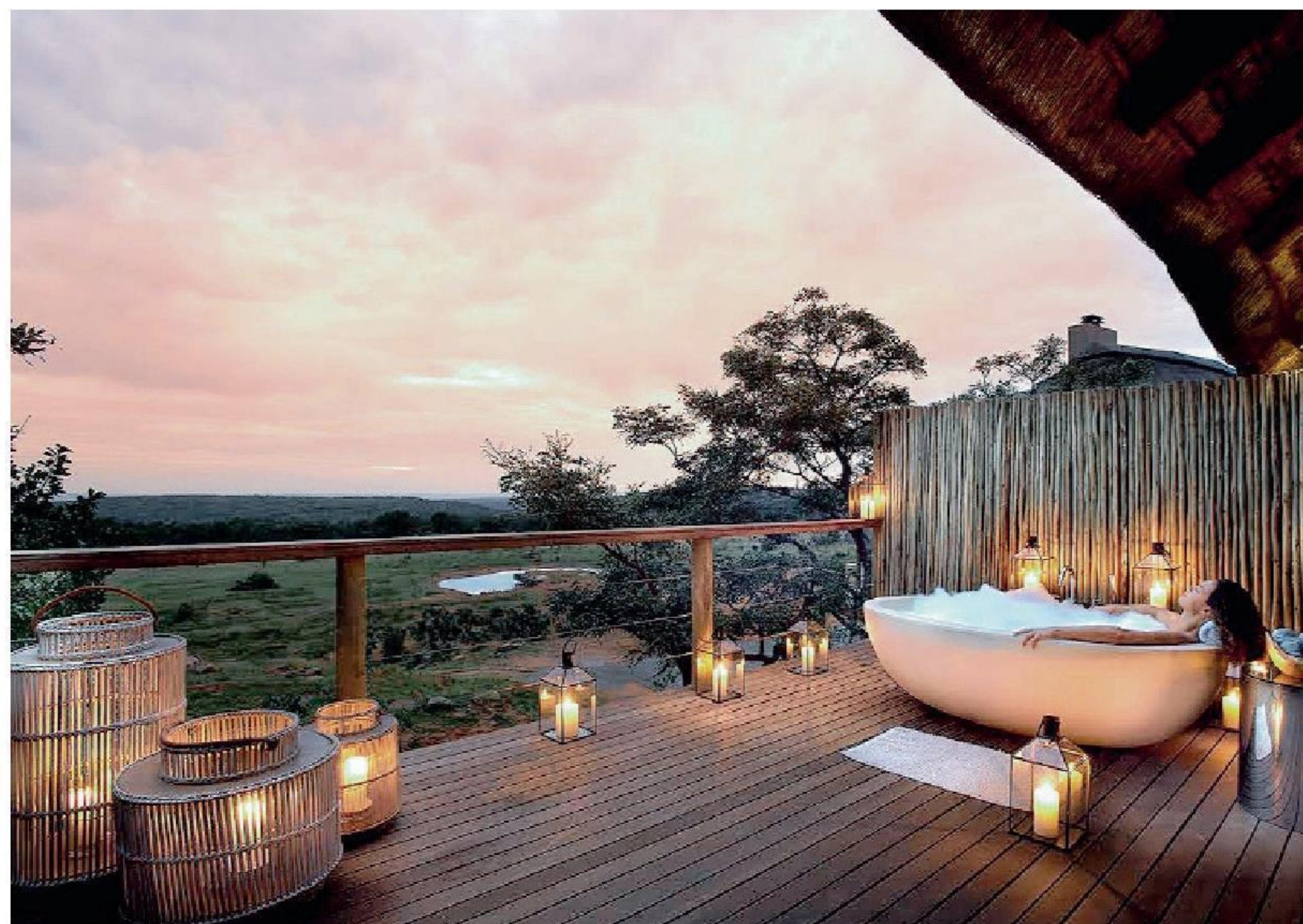
An outdoor bath allows one to soak up the views and bush sounds.

Dinner on the first night was in the elegant restaurant and, on the second night, in a boma with a huge fire. The menu emphasises healthy