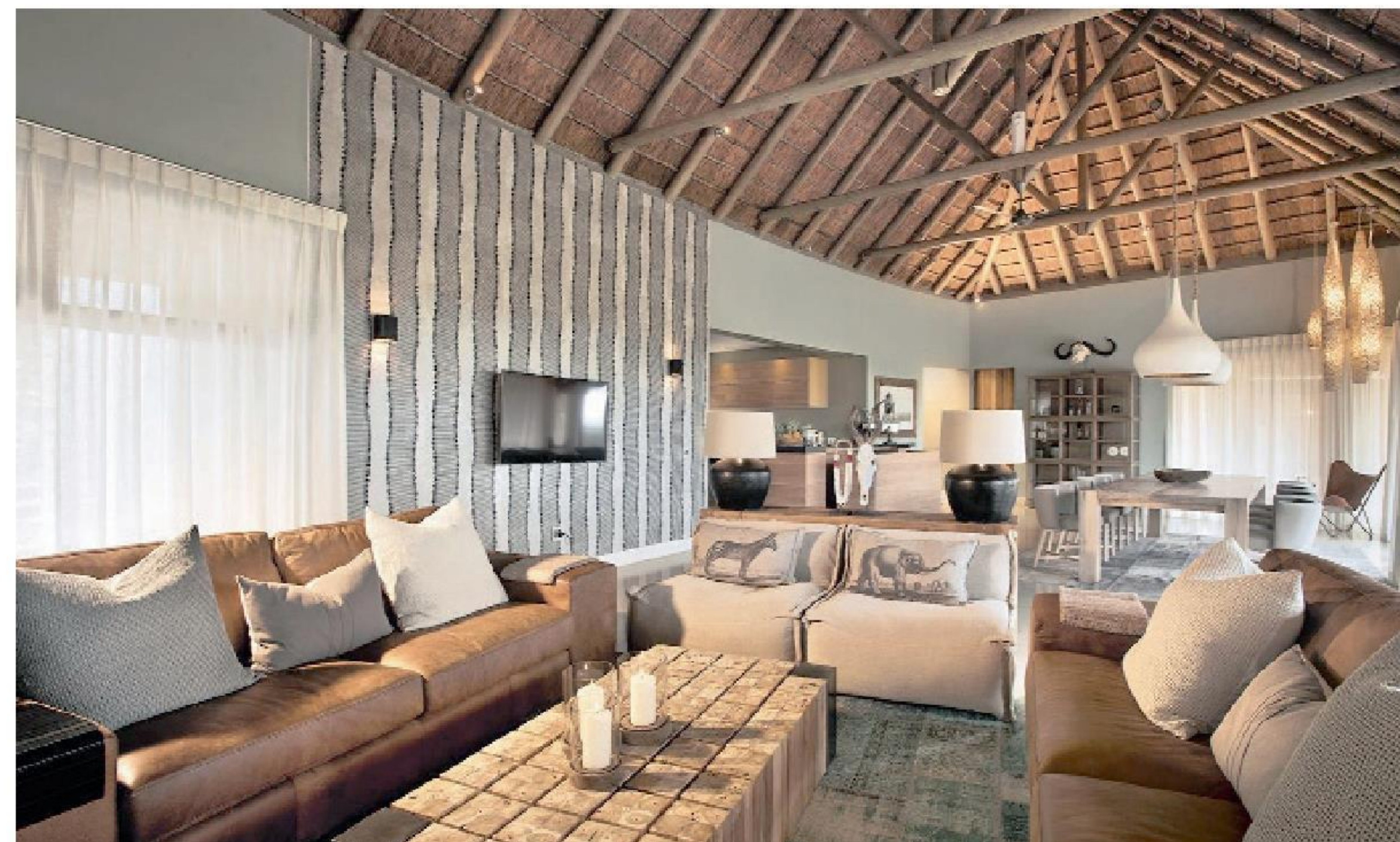
The lodge, with its comfortable furnishings, has a bushveld feel.