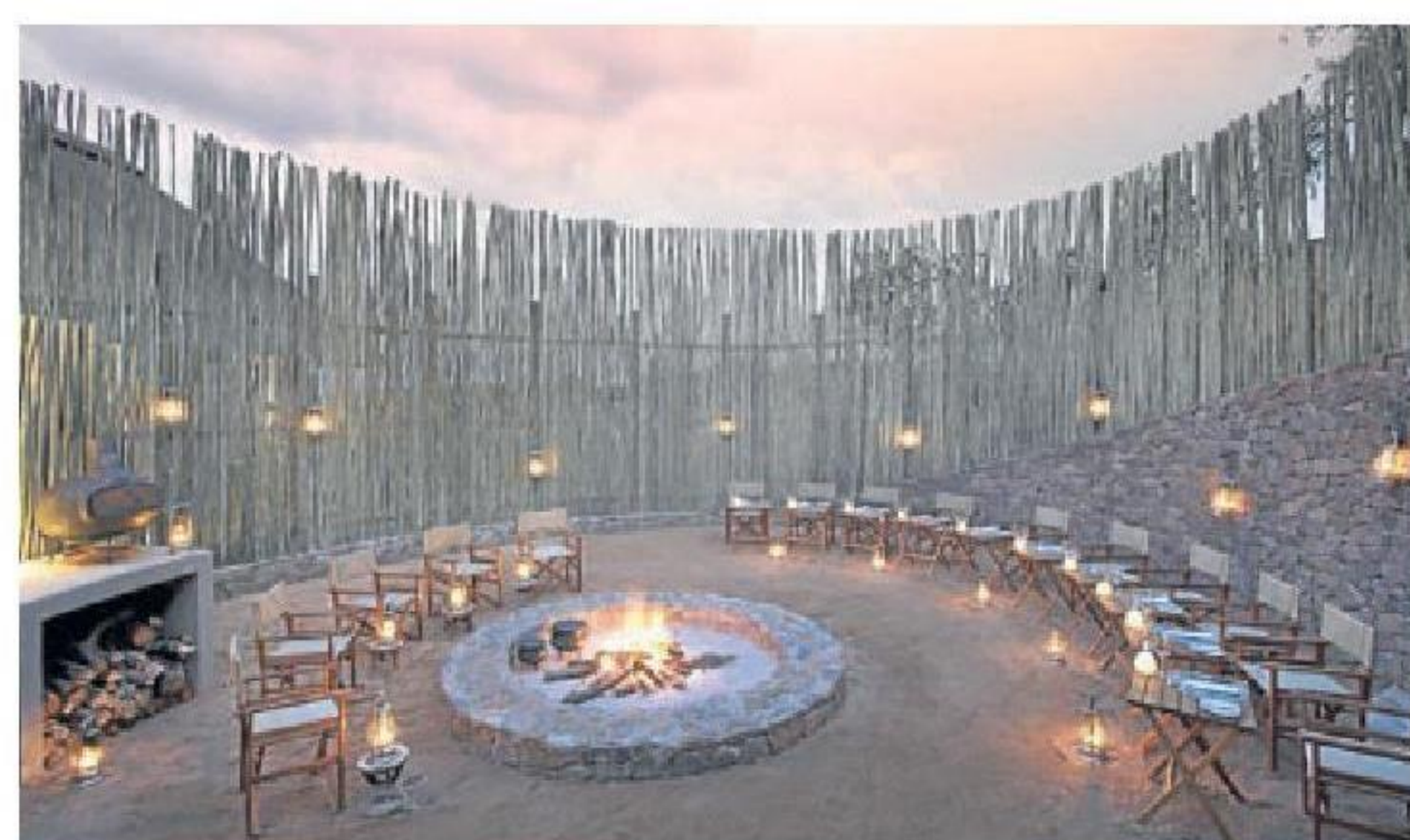
The fire area takes you into the lost world