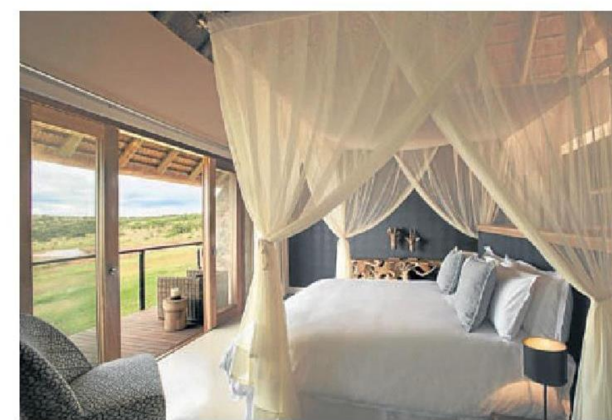
The spacious and luxurious bedroom has enough sunlight

On my first day I savoured the room and watched the sunset from the heated plunge pool. The lodge can accommodate 14 to 18 guests in their four suites, but those with